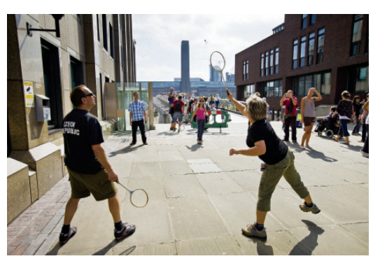
Photographs of From Morning Till Night, London, September 2011.